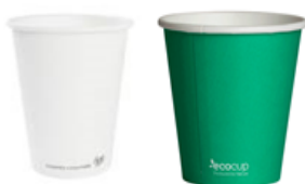
Hot and cold drinks

Cups: These cups look very similar to regular coffee cups but have a thin plant-based PLA lining instead of the plastic lining. They will break down in commercial composting environments